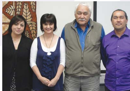
Pictured above, Knowledge Day 2010.