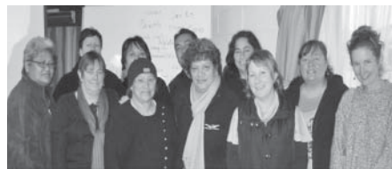
Attendees of an all day Tiaki Tinana workshop held in Kaitiaki. This workshop was well attended by members of social service and community organisations from all over the far north region. Discussion and feedback highlighted the great need for information and support around sexual violence prevention for Maori in rural areas. July 2009.