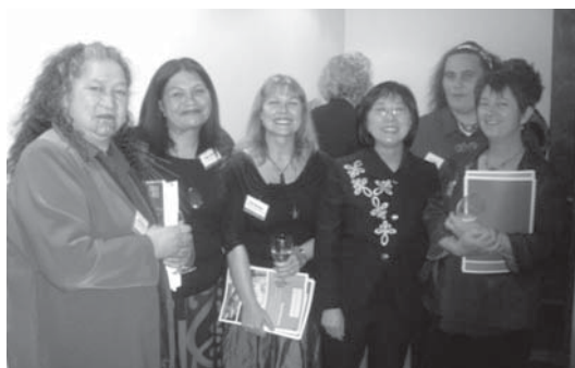
Dr McGregor and colleagues from Te Ohaakii a Hine – National Network Ending Sexual Violence Together (TOAH-NNEST) pictured with Minister of Women's Affairs Pansy Wong at the release of five reports from the MoWA's Sexual Violence Research Project. October 2009.

Given these rates, it can be derived that the overwhelming majority of accused offenders (more than 98%) are free to continue to sexually offend against children, women and men in New Zealand. In this regard, work on the primary prevention of sexual violence is paramount.