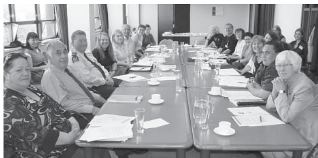
The TASV team included government officials and TOAH-NNEST members.